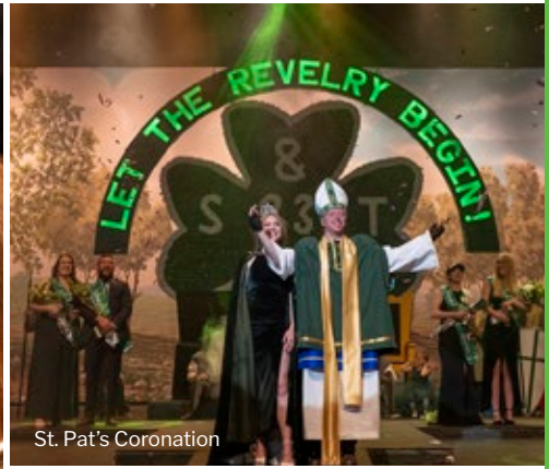
St. Pat's Coronation