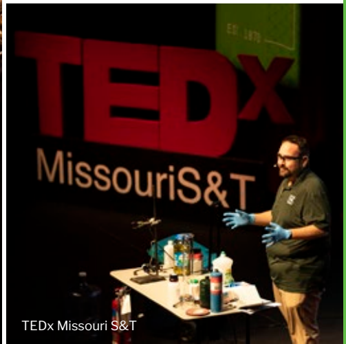
TEDx Missouri S&T